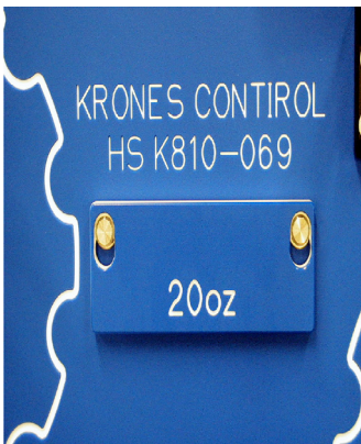
Removable ID Plaque