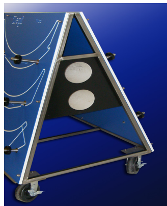
Internal Feed Screw Holder